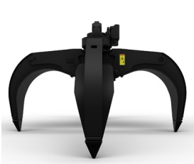
GSH – ORANGE PEEL GRAPPLES

Match your machine to the job. The MH3026 offers four boom and stick combinations. The boom and stick options as well as two undercarriage configurations allow you to customize your machine to meet the demands of your application.