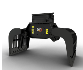
DEMO AND SORTING GRAPPLES