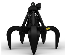
GSV – ORANGE PEEL GRAPPLES